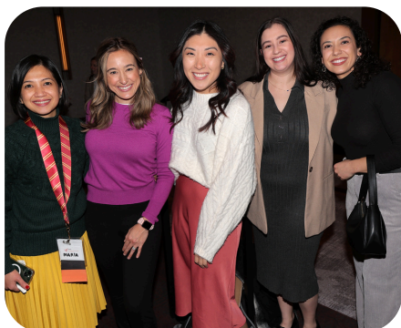
CSM Donor Networking Reception