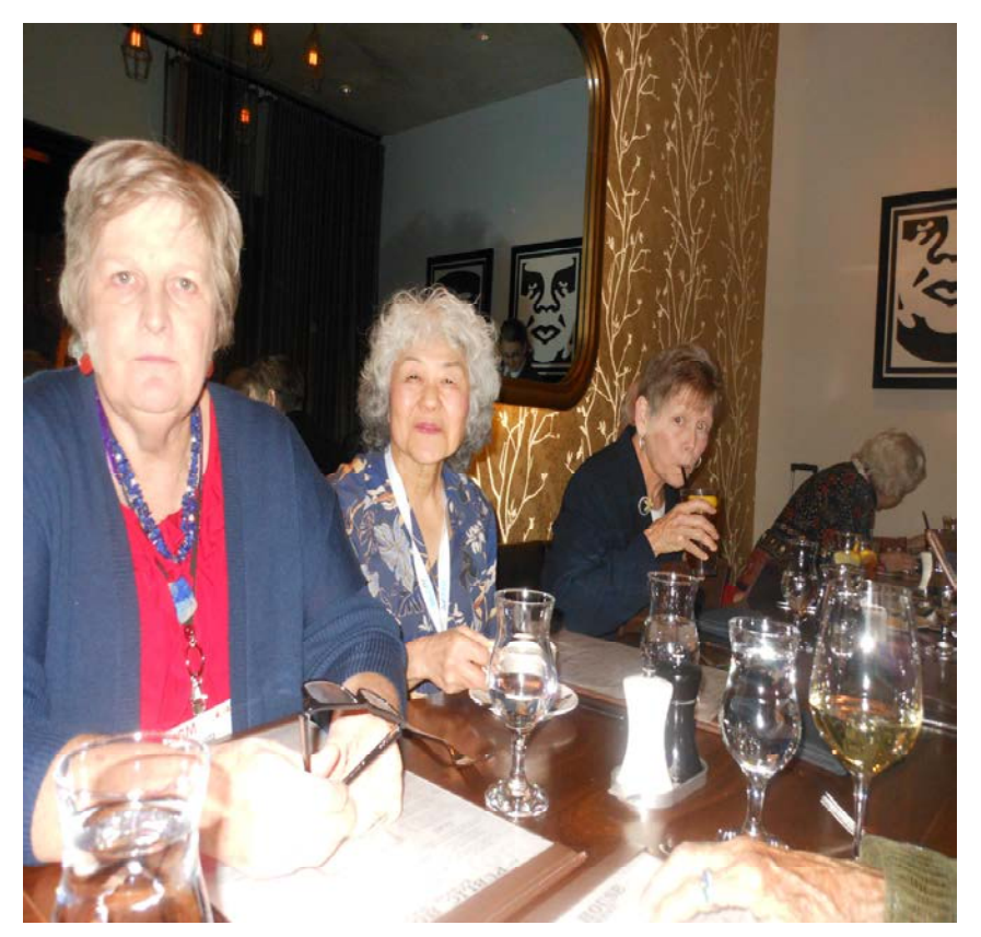
APTA-NEXT Charlotte, NC